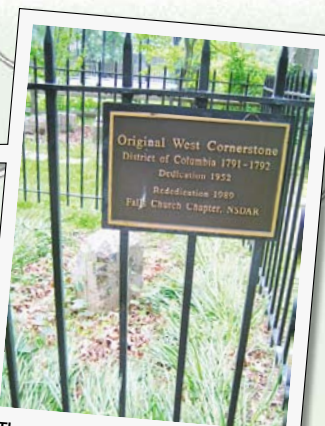
The west cornerstone sits in Andrew Ellicott Park between houses on a quiet street. Several blocks away, Lazy Sundae serves up ice cream treats.