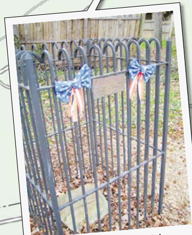
Detour a few blocks south of the SW 5 stone on South Walter Reed Drive to the Rachel M. Schlesinger Concert Hall and Arts Center , which features orchestral music, dance and other performing arts.

WEDNESDAY IN STYLE | Escapes hops on its bike for a Tour de Virginia.