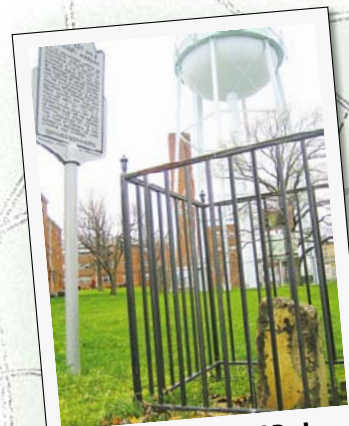
At Upton Hill Regional Park , east of the SW 8 stone in Patrick Henry Apartments' parking lot, athletic types can hike, swim, play miniature golf or batter up in the batting cage.