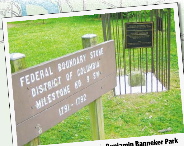
Walk east from the SW 9 stone in Benjamin Banneker Park along the Washington & Old Dominion Trail and look for the historical marker for Brandymore Castle , a clump of rocks atop a hill.

WHERE: Alexandria, Arlington and Falls Church.