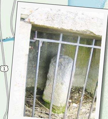
The eroded stub of the south cornerstone sits inside the seawall under Jones Point Lighthouse , which once guided ships along the Potomac.